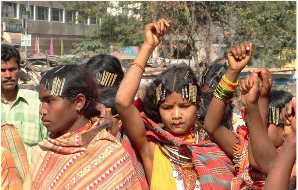
The culture of one of India's most isolated tribes, the Dongria Kondh, is being threatened by Vedanta Resources.

The LAPFF will continue participation in UN PRI group and continue to monitor company progress through 2010 to determine potential candidacy as a target for a shareholder resolution in 2011.